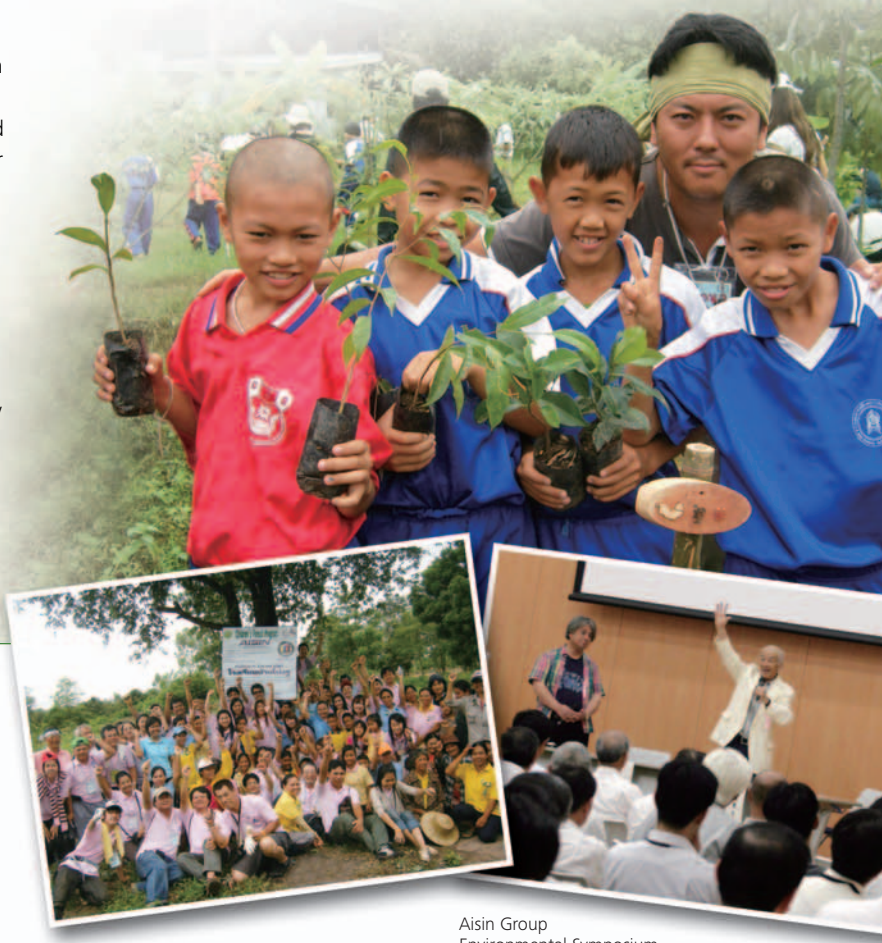
Aisin Group Environmental Symposium

period. Furthermore, we consider these programs to have given the many participating children a sense of the preciousness of the natural environment.