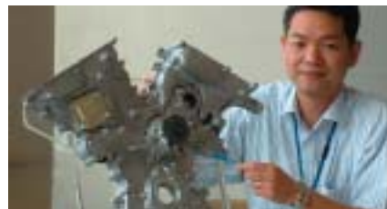
Engine front module integrating the functional components such as water and oil pumps

AISIN undertook product development in an environmentally friendly manner ensuring energy conservation and reduction of air and water pollution, and released such products as the gas engine cogeneration system.