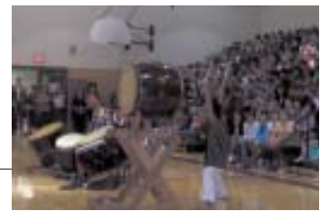
Japanese taiko (“drum”) performances

promoting relations with communities through the hosting of such Japanese cultural events as sumo competitions and Japanese taiko (“drum”) performances.