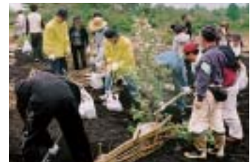
Mount Fuji tree-planting tour

Aisin Seiki hosts the Nobikko Shinrin-tai (Sapling Forest Team Event), during which people can learn about the current state of forests through a hands-on tree thinning experience, and conducts tree-planting activities on Mount Fuji. Moreover, efforts are also directed toward global environmental preservation activities through such measures as promotion of roof gardens at the AISIN com-center (Communications Hall) and at Aisin Seiki’s Kariya Plant.