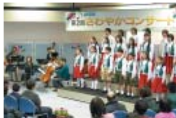
Aisin Sawayaka (“refreshing”) concert

Overseas, subsidiaries are pursuing such volunteer activities as the renovation of local retirement homes in disrepair and