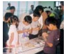
Aisin Mono-zukuri Hiroba (“Making Things Plaza”)

AISIN encourages children to learn about the fun and wonder of creation, or mono-zukuri through the Aisin Mono-zukuri Hiroba (“Making Things Plaza”) and by supporting such organizations as the Boys and Girls Invention Club in the Nishio region.