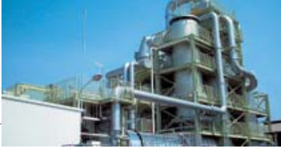
This waste incineration facility aids in the reduction of dioxin emissions

new waste incineration facility at the Nishio Plant—in use since June 2003—that has dramatically reduced dioxin emissions to well below existing standards.