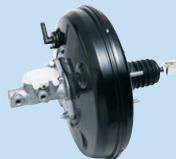
Master cylinders with brake boosters

ADVICS Automotiva Latin America Ltda. commenced local production of brake parts.