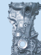
Oil pump with timing chain case

Aisin Automotive Karnataka Pvt. Ltd. commenced deliveries of engine parts to Tata Motors Limited.