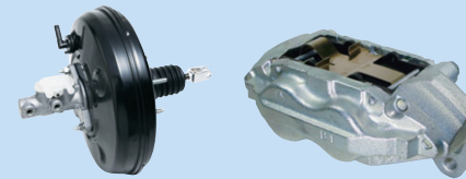
Master cylinders with brake boosters

ADVICS South Africa (Pty) Ltd. commenced production of brake parts.